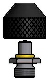
Model of valve stem 7/8" 14 UNF (B)